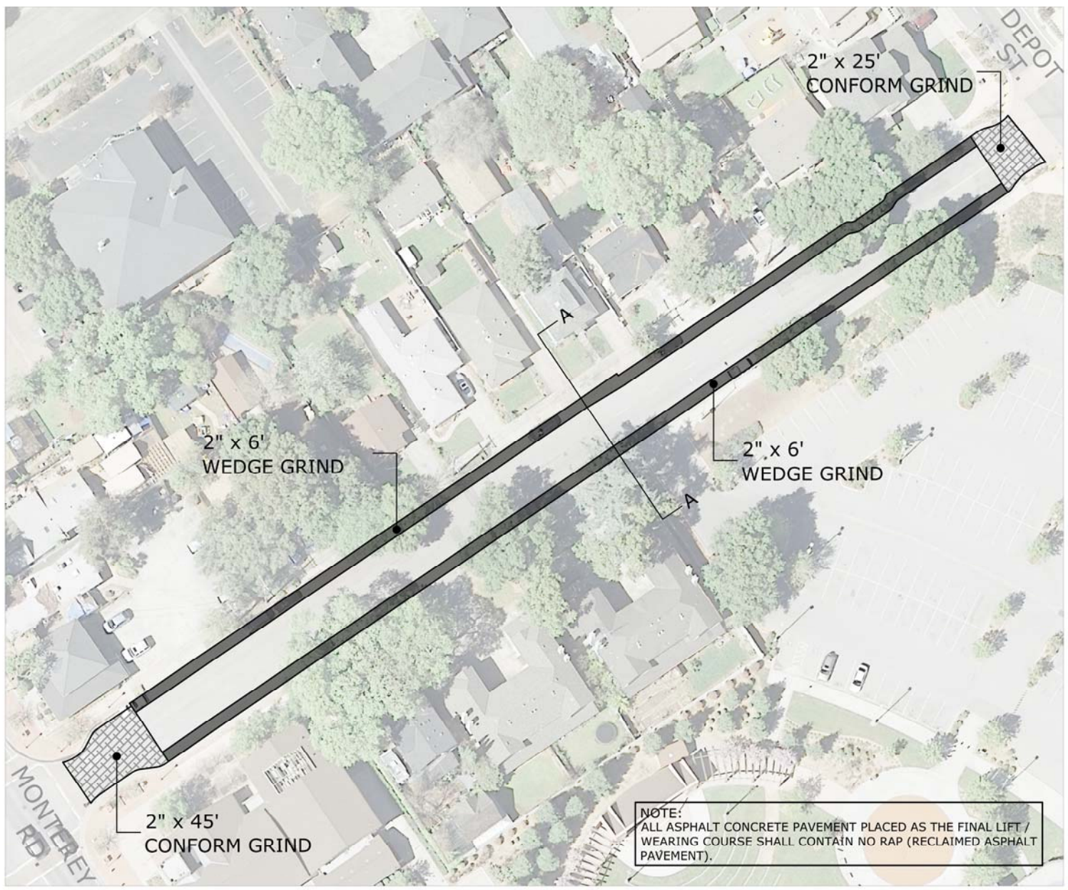
SECTION "A-A" FIFTH STREET LOOKING EAST N.T.S.

NOTE: ALL ASPHALT CONCRETE PAVEMENT PLACED AS THE FINAL LIFT / WEARING COURSE SHALL CONTAIN NO RAP (RECLAIMED ASPHALT PAVEMENT).